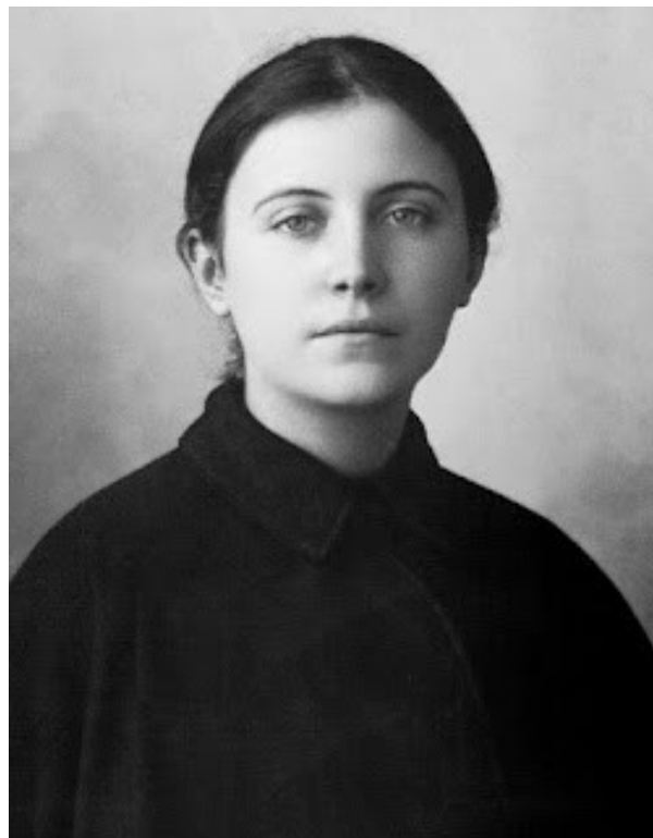
St Gemma Galgani