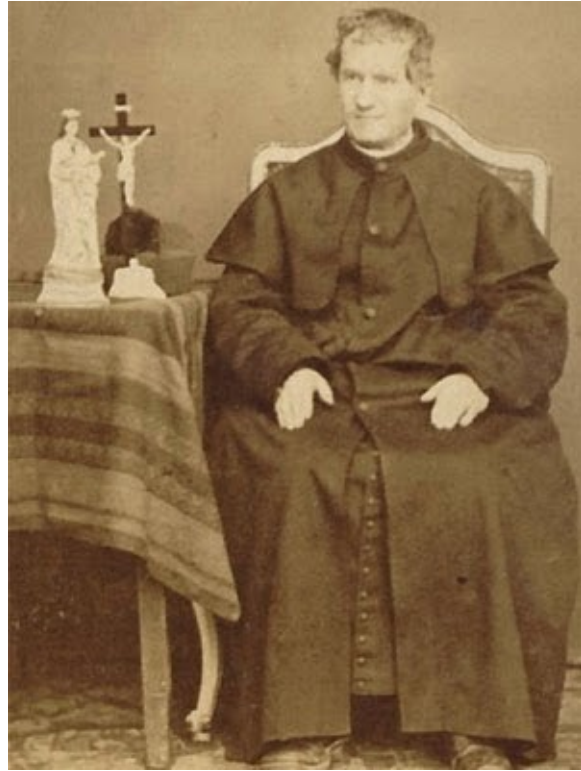
St John Bosco

But they, having hard hearts and being indifferent to his words were deaf to the saint's exhortation. I saw the fire surround them while they were trying to escape. This did not seem as a vision to me, since I felt I was awake with all my senses. Even today when I remember, I shudder seeing those hardened souls that preferred to be burned instead of obeying Don Bosco's voice. But those who were under Mary's mantle were safe."