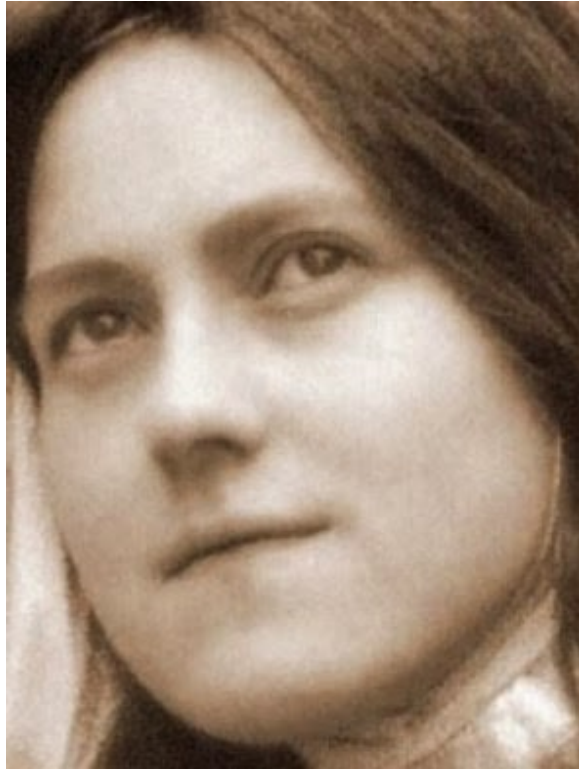
St Therese of Lisieux