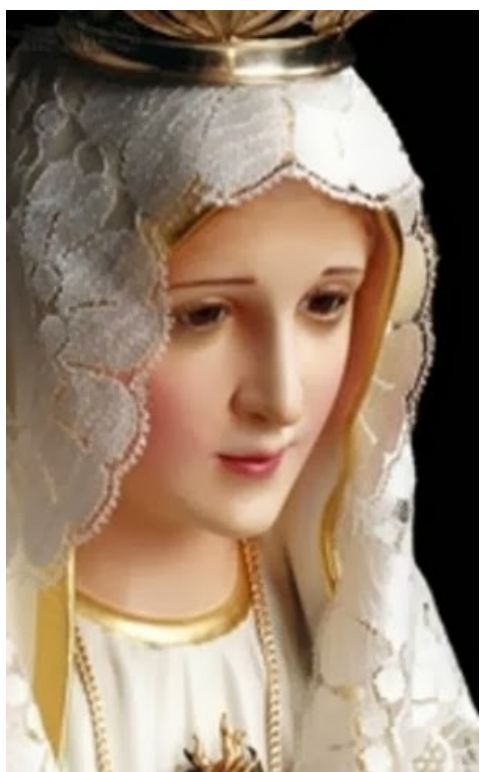
Blessed Virgin Mary